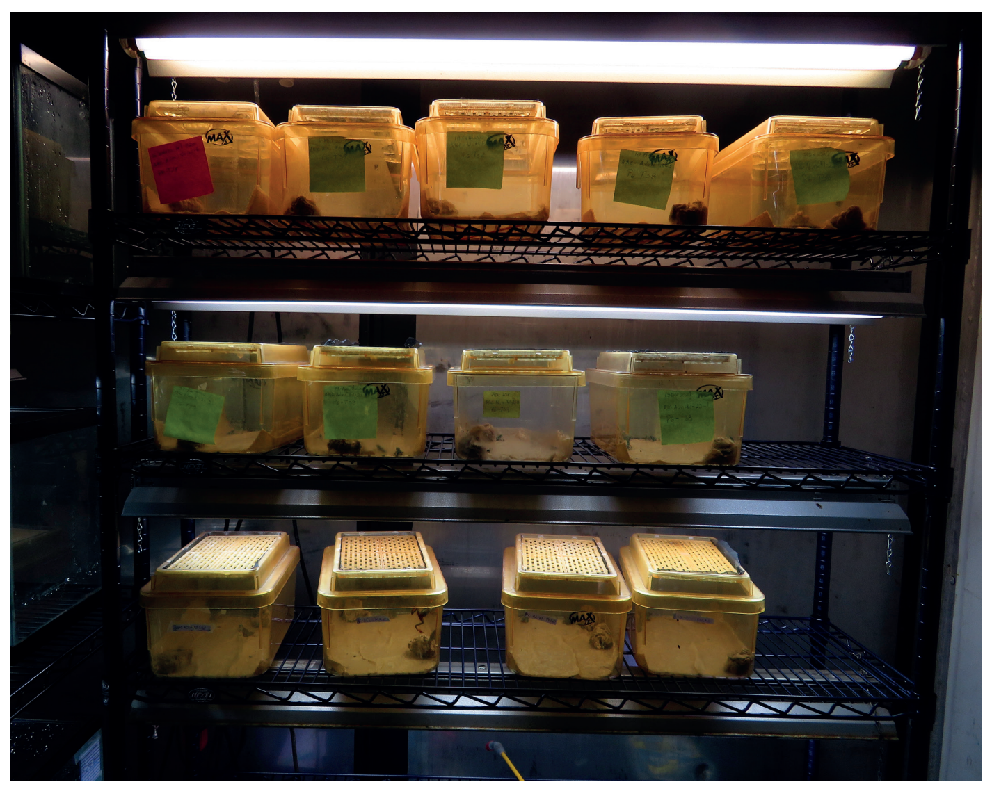
Keeping different Atelopus species on wet pulp at the Panama Amphibian Rescue and Conservation Center.

The advantage of this housing method is the better control of the animals and the amount of food consumed, as well as the lower risk of parasites and pathogens becoming rampant. However, humidity and temperature are less constant and require more intensive monitoring.