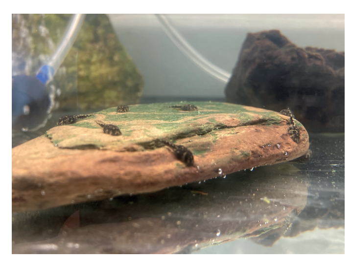
View into a rearing tank - the larvae of Atelopus balios attach themselves to the stones, from which they also graze the algae growth

In their natural habitat, tadpoles of this species mainly rasp algae off stones, which is why the diet in the tank must be adapted to this behaviour. For this purpose, spirulina mixed with other algae (chlorella), boiled dandelion leaves and a smaller portion of "Sera Micron" is mixed with water to form a paste that can be applied to stones and glass plates. After drying, these can be placed in the tank so that the burbot can then scrape off the food. Alternatively, you can also offer algae-covered stones that have previously been placed in separate tanks for growing. Diatoms, which are weak in competition, seem to be particularly suitable for this purpose. A description of diatom breeding and further information on tadpole rearing in Atelopus can be found in Poole (2006).