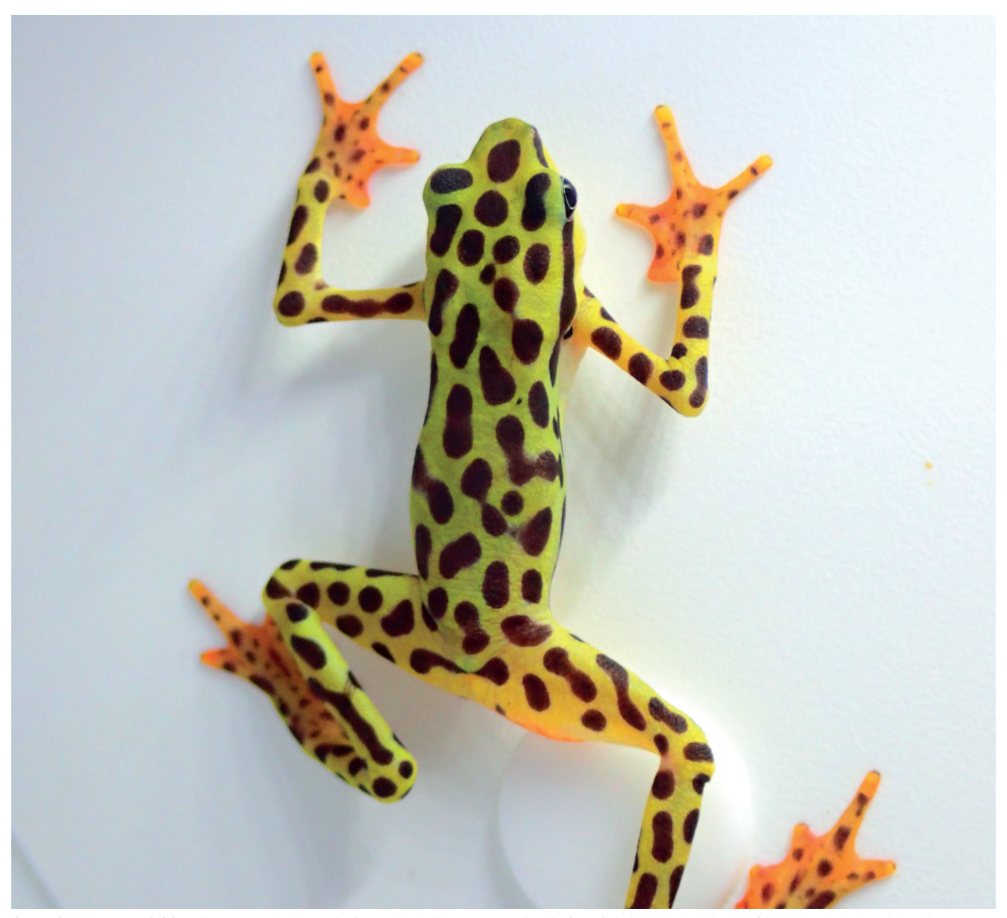
One of the aims of CC is to generate knowledge about the species kept. Careful documentation of the animals kept by the keepers and regular stock reports to the CC office are important components of this. I Amadeus Plewnia

With every change of location within CC, i.e. the change of animals from one person to the next, veterinary tests are to be carried out beforehand, a skin swab for the chytrid fungus Bd and a faecal sample for parasites are to be obligatory, if necessary Bsal will also be tested. Instructions and the necessary dry swab and faecal sample tubes are provided by CC, the examination costs are borne by CC. A corresponding examination order for a suitable examination laboratory is available from the CC office.