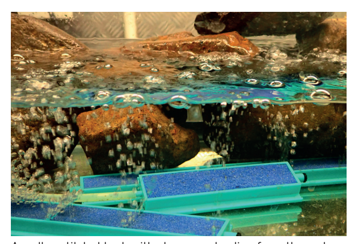
A well ventilated tank with stones protruding from the water and dry in the upper area serves for spawning. I Amadeus Plewnia