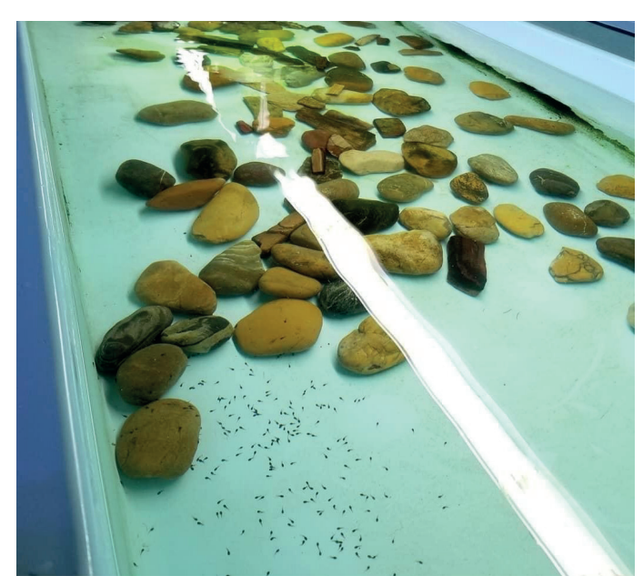
Stream pool for rearing Atelopus tadpoles | Nick Stacey