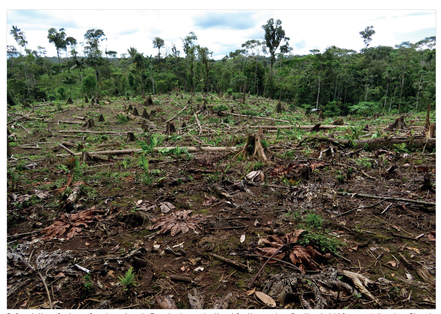
Deforestation of primary forests, as here in Ecuador, is a major threat for the species after the chytrid fungus.

After dramatic population losses due to the chytrid fungus Bd , no surviving populations of A. balios were known, so that in the 1990s there were fears that the species was already extinct. However, intensive searches fortunately led to the rediscovery of several populations, some of which appear to be stable. In addition to the enormous threat posed by chytridiomycosis, anthropogenic (human-induced) pressure on the natural habitats of the species is currently increasing strongly. The Pacific lowland rainforests of Ecuador are experiencing enormous rates of deforestation, but at least one known occurence of A. balios is in a designated protected are.