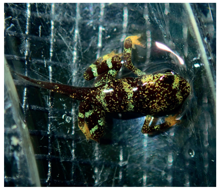
After the landing, the metamorphosed juvenile toads first resorb their tail remnant.

As hygienic husbandry is particularly important for young animals, they can alternatively be reared in smaller containers with moist cellulose as a substrate, which should be changed every two days. It should also be noted that the containers for the tiny young toads must be escape-proof.