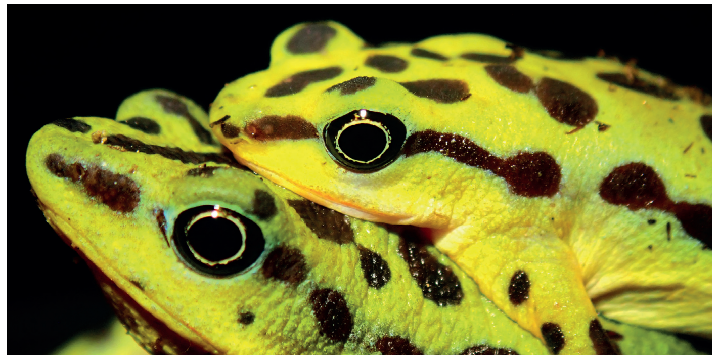
Health risk permanent amplexus | Amadeus Plewnia

Drowning: As already mentioned, Atelopus balios is a poor swimmer despite its close attachment to streams. In deeper water, the animals panic easily if they cannot "get out" easily. They then swim around frantically, quickly lose strength and possibly eventually drown - a common keeping problem with Atelopus species.