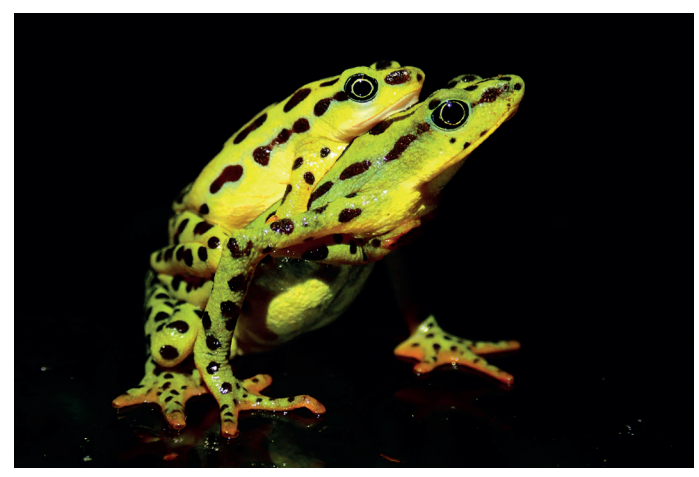
Atelopus balios in Amplexus

The spawn is laid in the form of strings with white eggs and attached to the underside of stones. Fresh spawn is sensitive to light and should not be manipulated under any circumstances. Whether spawning has occurred can be easily determined by the body volume of the female.