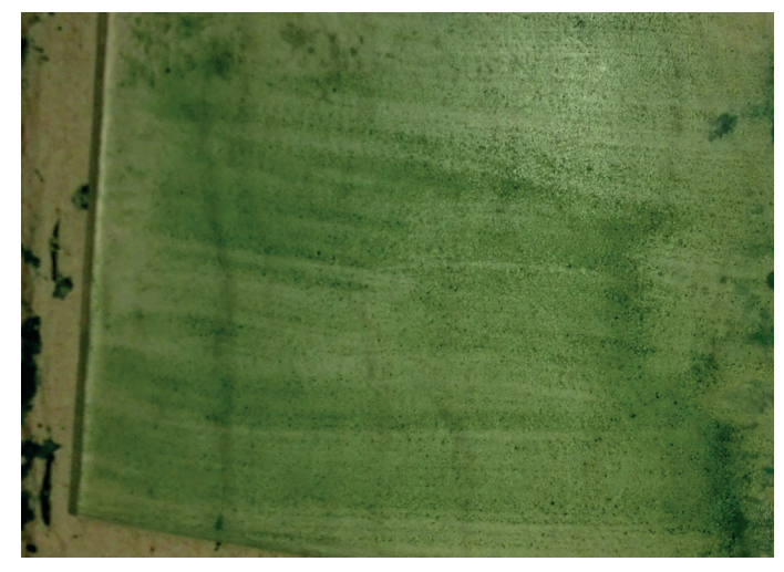
Food is placed on glass plates or stones to be eaten by the tadpoles. I Amadeus Plewnia

In their natural habitat, tadpoles of this species mainly rasp algae off stones, which is why the diet in the tank must be adapted to this behaviour. For this purpose, spirulina mixed with other algae (chlorella), boiled dandelion leaves and a smaller portion of "Sera Micron" is mixed with water to form a paste that can be applied to stones and glass plates. After drying, these can be placed in the tank so that the burbot can then scrape off the food. Alternatively, you can also offer algae-covered stones that have previously been placed in separate tanks for growing. Diatoms, which are weak in competition, seem to be particularly suitable for this purpose. A description of diatom breeding and further information on tadpole rearing in Atelopus can be found in Poole (2006).