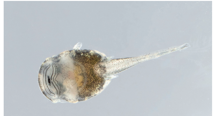
Dorsal and abdominal view of a tadpole of Atelopus balios

Metamorph of Atelopus balios - the land walk occurs at a stage when the young still have relatively long tails.