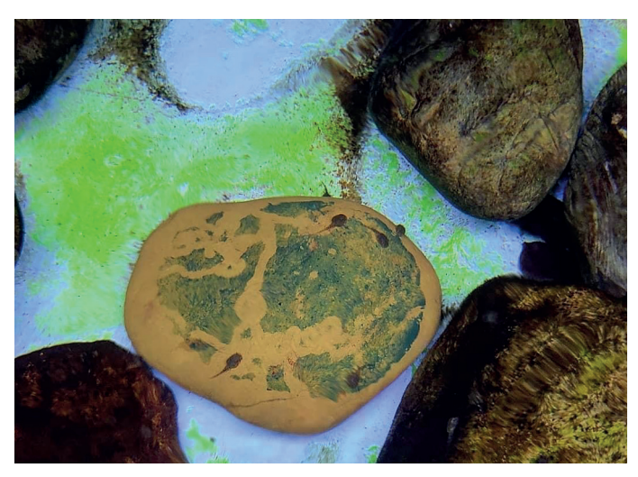
Algae serve as food for the tadpoles of Atelopus balios . I Nick Stacey