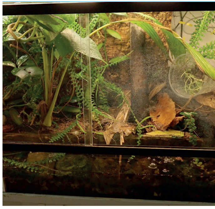
Naturally furnished terrariums for keeping Atelopus balios I Amadeus Plewnia