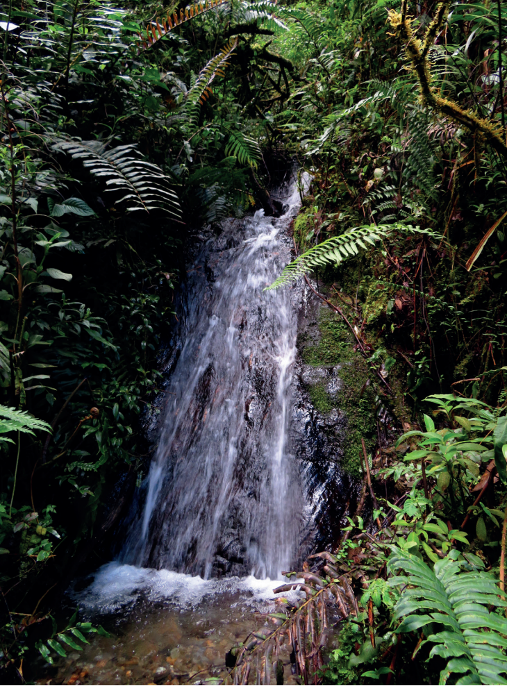
Typical habitat of harlequin toads in the Ecuadorian rainforest

The genus Atelopus (Harlequin toads, stubfoot toads) belongs to the toad family (Bufonidae) within the order frogs (Anura). In English, Atelopus are often called Harlequin or Stubfoot frogs, despite their relationship to the toads. In the genus Atelopus, Atelopus balios probably belongs to a still little known species complex with Atelopus longibrachius, A. gracilis and A. elegans, all of which are native to the region west of the Andes. A. balios is a medium-sized Atelopus species with a head-torso length of