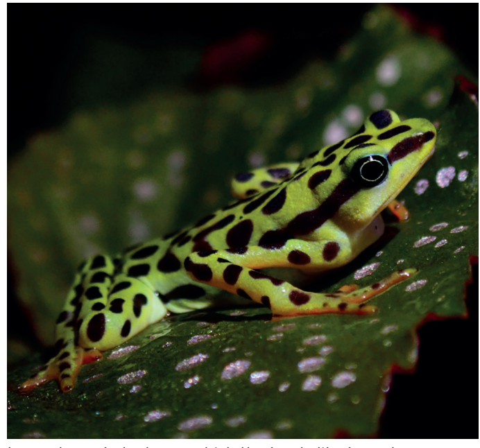
Large-leaved plants, on which the toads like to rest, are an important part of the terrarium setup. I Amadeus Plewnia