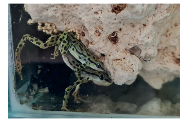
The spawning lines are attached to the underside of stones. I Raf Stassen