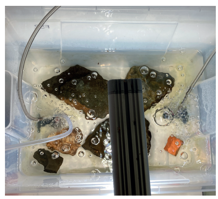
Well ventilated tank for burbot rearing

Water values for tadpole rearing of different Atelopus species according to experiences of the Panama Amphibian Rescue and Conservation Center