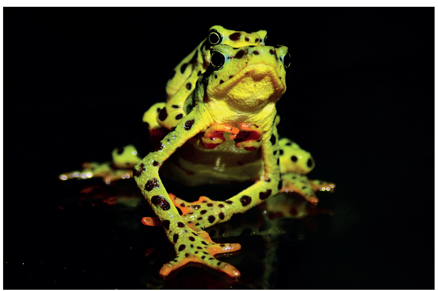
Atelopus balios in Amplexus | Amadeus Plewnia

The entire genus Atelopus (harlequin or stubfoot toads) often exemplifies an entire group of neotropical amphibians (i.e. those found in the American tropics) whose populations have collapsed massively since the 1980s due to the invasive chytrid fungus Batrachochytrium dendrobatidis ( Bd ), and therefore represents one of the most threatened animal genera in the world (LA MARCA et al. 2005). Since chytrid fungi have led to the complete extinction of many species of stubfoot toads even in pristine rainforests and cloud forests, classical conservation measures such as the designation of protected areas alone are not effective. Instead, the last hope for many Atelopus species lies in ex situ conservation breeding projects, i.e. conservation in terrariums in human care.