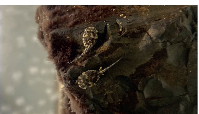
Larvae of the harlequin toads suck themselves to the substrate to avoid being carried away by the current. I Amadeus Plewnia