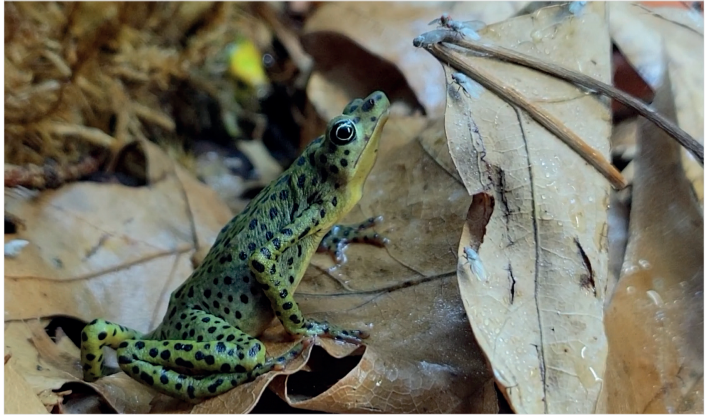
Atelopus balios are cautious eaters, so that sufficient food density must always be provided in the terrarium - as here with fruit flies. Lukas Reese, Zoo Karlsruhe