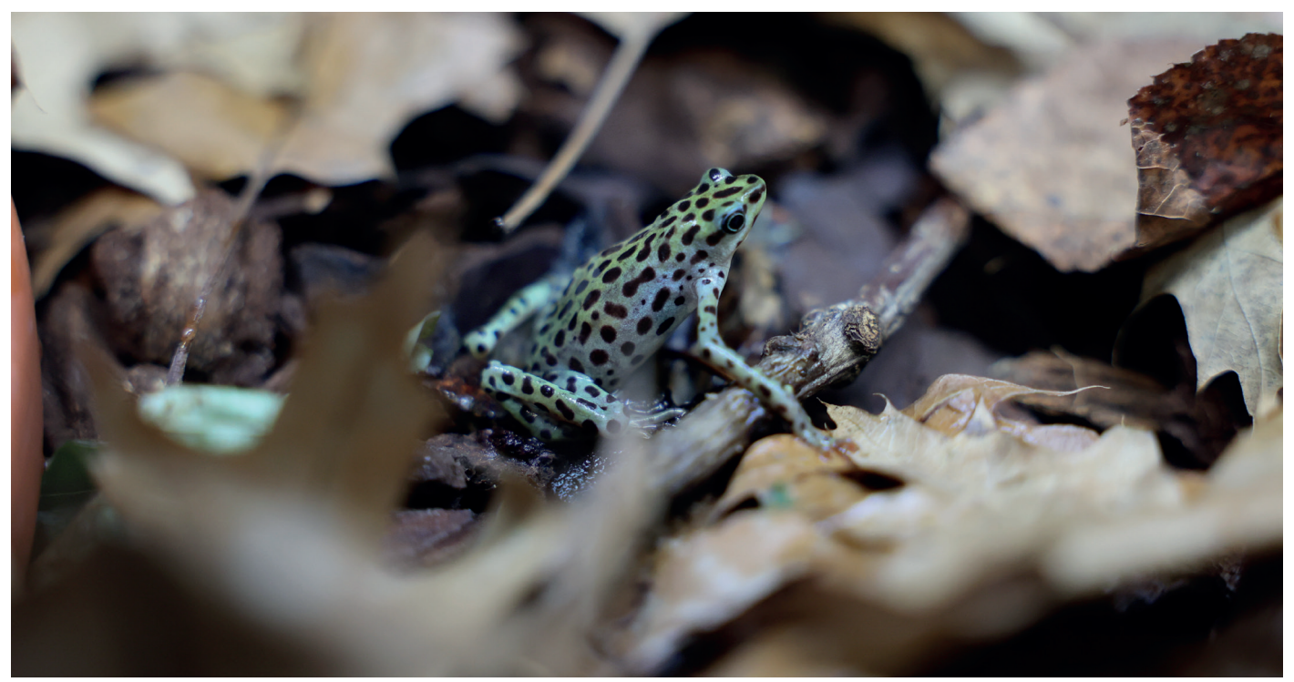
Foliage can be used well to cover the substrate.

Climbing branches, roots, lianas and similar furnishings provide further structural elements, movement areas and hiding places. It is best to tie the plants onto these structures and cultivate them purely epiphytically (without soil) - this makes hygienic maintenance work easier. The side walls are best designed in such a way that they offer the toads additional space to move around and, if necessary, hiding places. For this purpose, modelled polystyrene, peat or cork board walls are suitable, for example. In order to prevent bacterial infections, it is very important that the toads have dry places in the terrarium despite the tropical and humid environment. The ventilation should therefore be dimensioned in such a way that the plants are dried off again two hours after spraying.