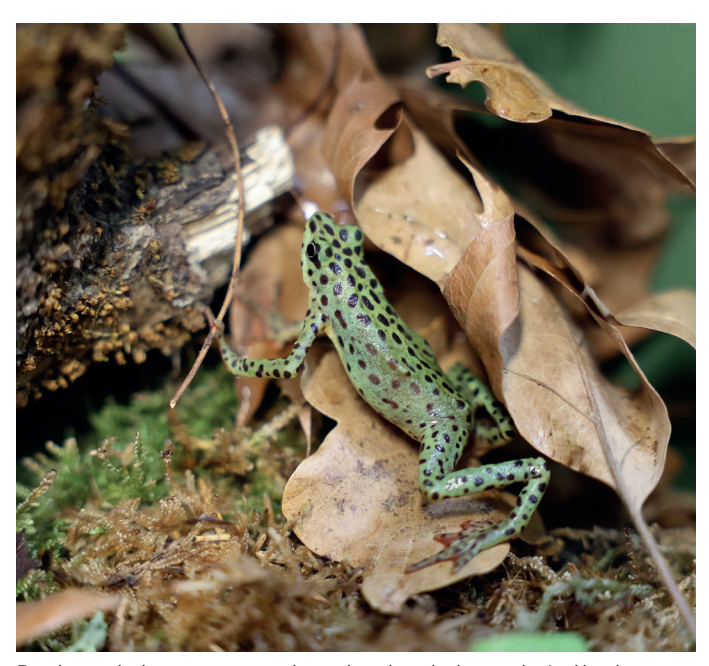
Roots and stones are used as structural elements in the terrarium. It is important to always provide dry places even in the tropical humid terrarium!

around in the amplexus until the female also becomes ready to reproduce. However, this can sometimes take days or weeks. This prolonged amplexus involves risks for the animals because the male does not eat during this time and can lose weight, or because the long (or too frequent) clinging can cause sores in the female. Therefore, it is safest and most promising to keep several animals separated by sex, e.g. two males and two females in one terrarium each, and then put them together in the spawning tank for mating. If both sexes are kept together permanently, care must be taken that amplexus does not occur too often or for too long; if necessary, the males must then be carefully separated from the females (see 4.9).