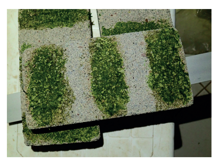
Stones covered with Spirulina | Amadeus Plewnia