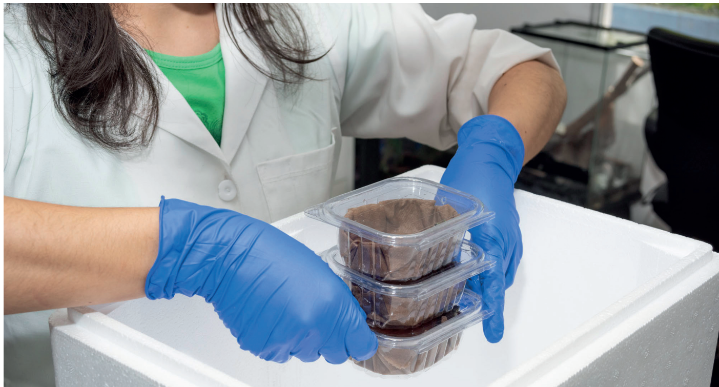
For shipping, the toads are placed individually in small pastic boxes lined with moist cellulose paper. These boxes are then placed in a well-insulated transport box and secured against slipping. | Wikiri