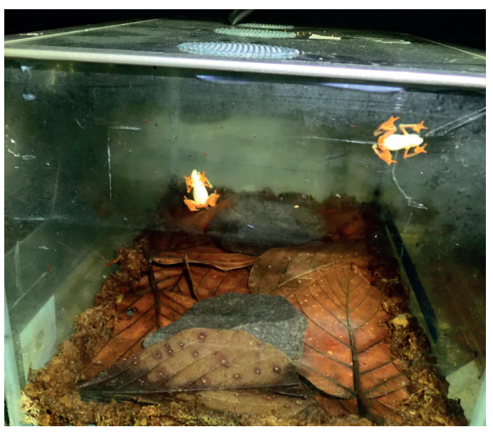
Rearing tank for A. elegans, closely related to Atelopus balios, at Centro Jambatu, Quito | Amadeus Plewnia