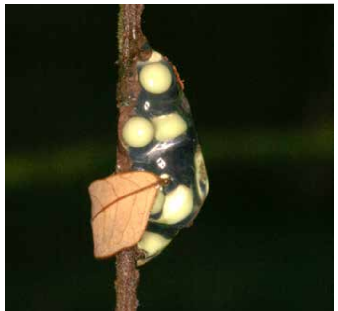
A clutch attached to a branch in the natural habitat