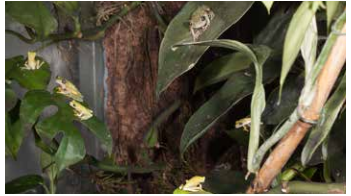
Establishing secure populations in human care could make the difference to the survival of this gravely endangered species

The 15th follow-up conference of signatory states to the Convention on International Trade in Endangered Species of Wild Fauna and Flora (CITES CoP15) in Doha in 2010 saw the entire genus Agalychnis being added to Appendix II following an application by Mexico. This decision was based on a misunderstanding, however, as Mexico had applied for such status only for five species, namely A. annae , A. callidryas , A. moreletii , A. saltator , and A. spurrelli . The error was rectified by the CITES Office via the "Notification to the Parties" No. 2011/042 on 4 Oct. 2011 ( https://cites.org/eng/node/1390/ , https://cites.org/sites/default/files/eng/notif/2011/E042.pdf ), clarifying that only the five mentioned species of Agalychnis were now included in Appendix II. Decisions by CITES are by default converted into EU Species Conservation Ordinances, with species listed in CITES Appendix II being incorporated into Annexure B of the EU Ordinance. This automatically compels keepers to have their specimens registered with the authorities by supplying evidence of being in their rightful possession and of their specimens' legal origin. Footnote 8 of the currently valid EU Species Conservation Ordinance points out that only the five mentioned species of Agalychnis are considered by CITES. All this boils down to the fact that, in spite of the