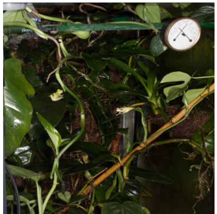
Creating a proper terrarium climate is crucial for keeping the frogs healthy and propagating them