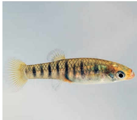
Females of Limia islai are less slender and have no gonopodium.