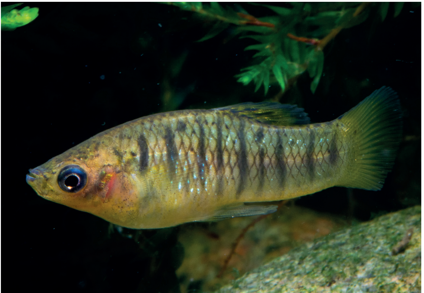
The males of Limia islai are slightly more colorful than the females.