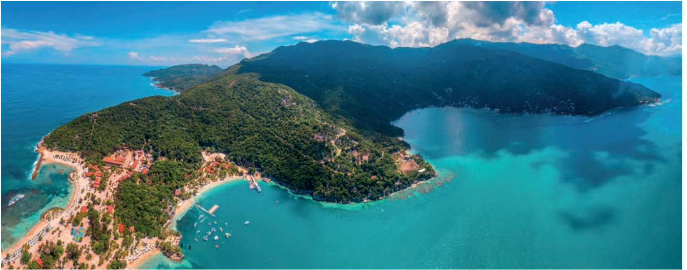
Limia islai lives in Lake Miragoane, the largest freshwater lake in the Caribbean, but habitat destruction and invasive species are causing problems for the Tiger Limia.

The Tiger Limia ( Limia islai ) was only described in 2020 and is already considered critically endangered. The species is listed as “Critically Endangered” in the IUCN Red List due to its small distribution area and the causes of endangerment mentioned below. The population trend is given as “unknown” (LYONS & RODRÍGUEZ-SILVA 2021).