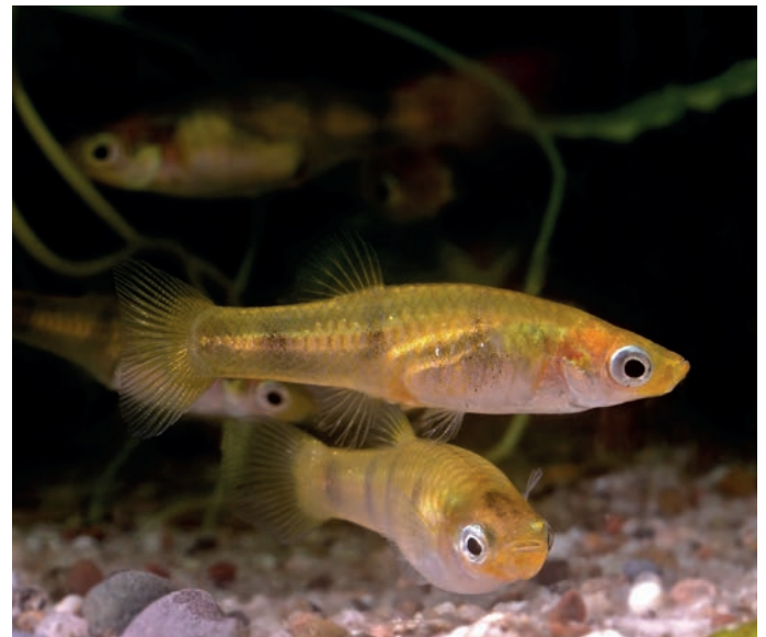
Female Tiger Limia are viviparous.

Under good husbandry conditions, the females give birth to young fish every four weeks without any further intervention by the keeper. Tiger Limia do not chase after their offspring, at least if they are regularly given animal food and sufficient cover. They accept crushed flake food from the start (and also like Artemia nauplii ), so the keeper does not need to take any further measures.