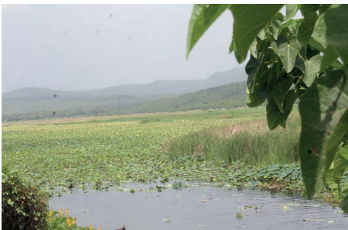
View of Lake Miragoane in Haiti