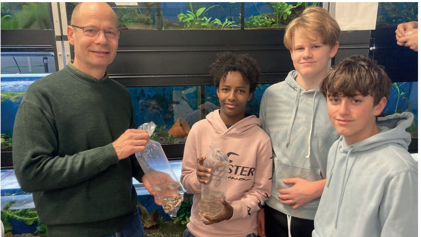
In November 2023, a group of Tiger Limia were safely packed and handed over to the Gymnasium Lerchenfeld in Hamburg. | Tim Olsson

The transport bag must be brought up to the temperature of the new aquarium before insertion. Water from the new tank should then be poured into the transport bag in small increments to acclimatize the fish to the environment of their new home. After about half an hour to an hour, the fish can be transferred to the holding tank using an aquarium net. The water from the transport bag is discarded to minimize the risk of introducing pathogens.