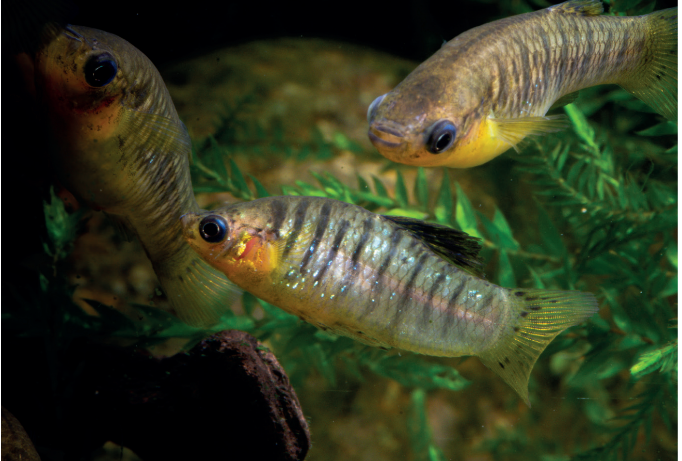
Tiger Limia are generally easy fish to keep.

Unfortunately, skewed sex ratios with an excess of male fish occur regularly. In other fish, many different external influences are known to be the cause, such as temperature, pH value, salt content or nutrition. So far, none of these factors have been confirmed for the Tiger Limia. In practice, a slightly lower proportion of females is sufficient to maintain and grow a breeding stock.