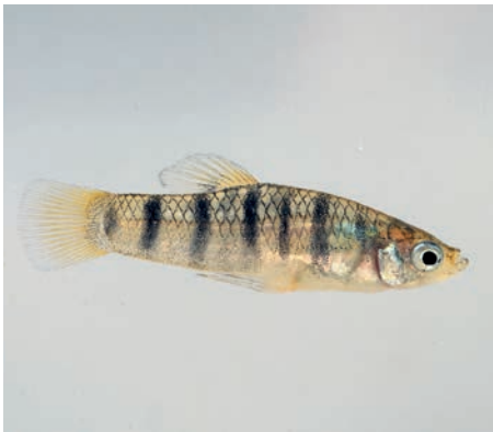
Male of Limia islai with clearly recognizable gonopodium | Manfred Scharl

The Tiger Limia differs from its close relative, the Humpbacked Limia ( Limia nigrofasciata ), in its smaller body size. The males of the Humpbacked Limia are significantly higher-backed and have an even more elongated dorsal fin. The differences in genital morphology are probably not accessible to the aquarist. In younger specimens, the differences are extremely slight.