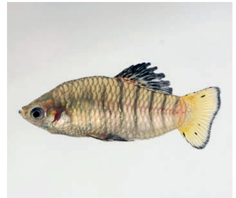
For comparison: A male of the species Limia nigrofasciata | Manfred Scharl