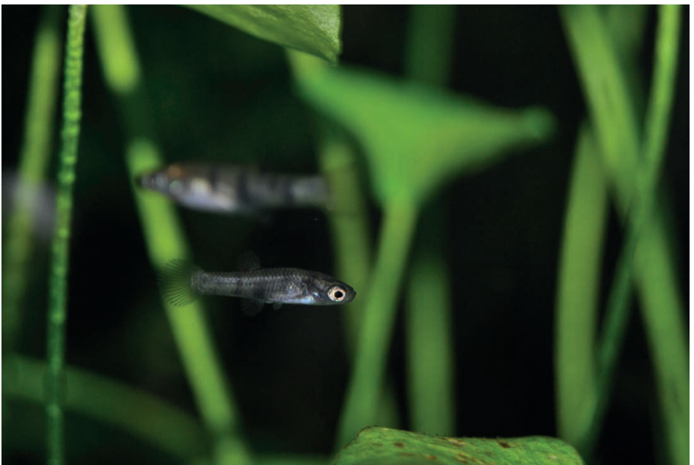
Limia islai has been classified as "Critically Endangered" by the IUCN.