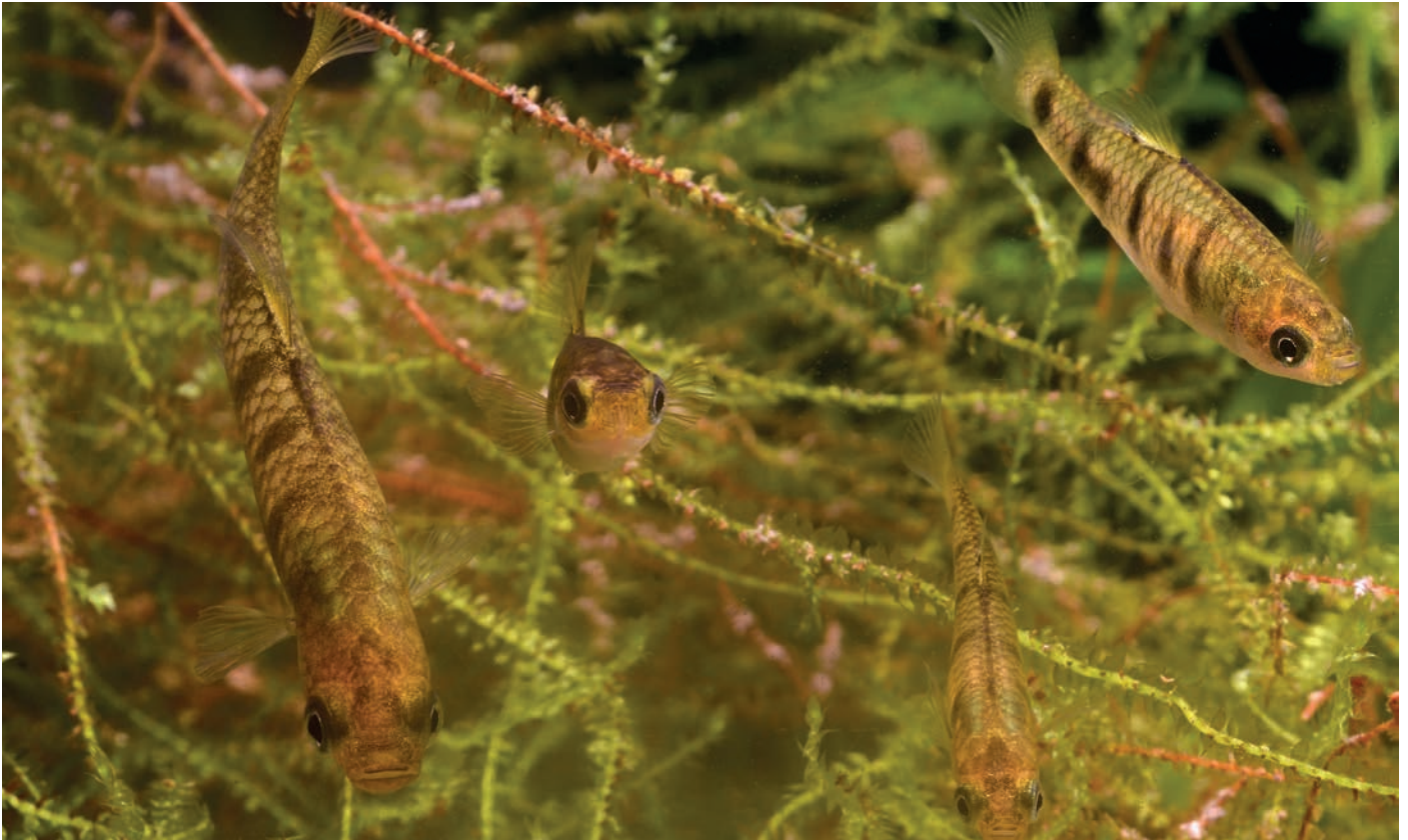
Tiger Limias between aquarium plants

Tiger Limias have a superior mouth. RODRIGUEZ-SILVA et al. (2022) investigated the volumetric food composition in situ during the rainy season: It consisted of 22.6 % algae, 13.3 % vascular plants, 3.7 % invertebrates, 2.3 % smaller fish and 58.1 % detritus (decomposing organic material, which may also have included parts of the so-called "Aufwuchs" – German „surface growth" or „overgrowth" – in the methodology of the study cited). In human care, Limia islai behaved in a markedly bottom-oriented manner for a poeciliid, while in others the orientation depended strongly on the setup and other factors such as the stocking.