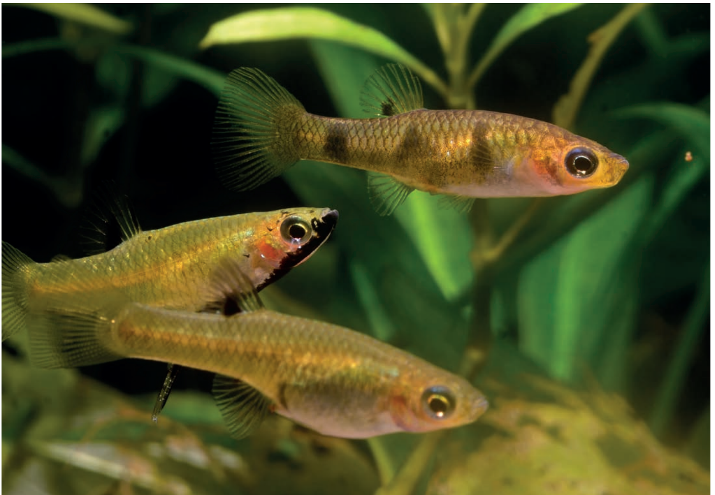
Girardinus metallicus for example, is suitable for socialization.

As appealing as a biotope aquarium in which you can directly compare Humpback and Tiger Limia may sound, it is not a good idea. There is a risk of the two species interbreeding, which should not happen under any circumstances in terms of a conservation breeding project.