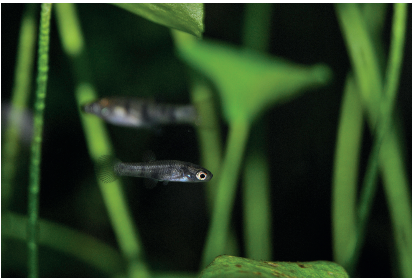
Limia islai has been classified as "Critically Endangered" by the IUCN.