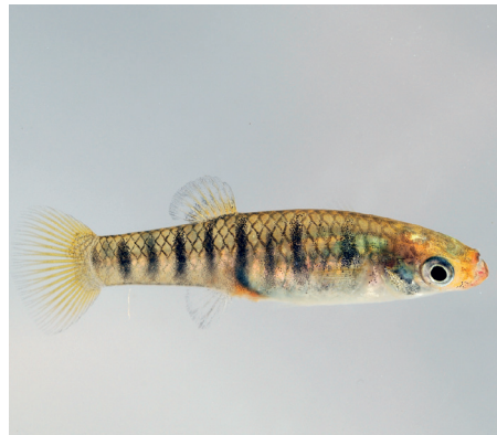
Females of Limia islai are less slender and have no gonopodium.