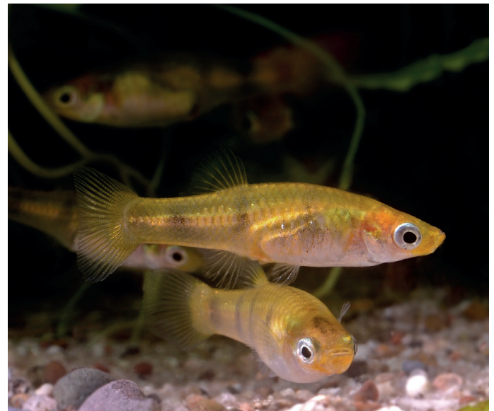
Female Tiger Limia are viviparous.

Under good husbandry conditions, the females give birth to young fish every four weeks without any further intervention by the keeper. Tiger Limia do not chase after their offspring, at least if they are regularly given animal food and sufficient cover. They accept crushed flake food from the start (and also like Artemia nauplii ), so the keeper does not need to take any further measures.