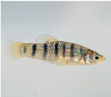
Male of Limia islai with clearly recognizable gonopodium | Manfred Scharl

The Tiger Limia differs from its close relative, the Humpbacked Limia ( Limia nigrofasciata ), in its smaller body size. The males of the Humpbacked Limia are significantly higher-backed and have an even more elongated dorsal fin. The differences in genital morphology are probably not accessible to the aquarist. In younger specimens, the differences are extremely slight.