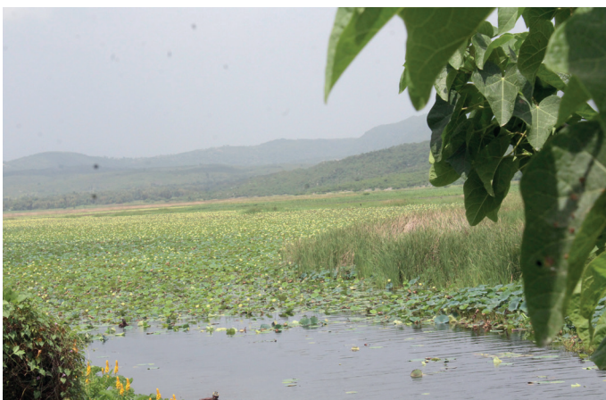
View of Lake Miragoane in Haiti

The great zoological specialty of the lake, however, are the poeciliids from the genus Limia . Like the cichlids of Lake Tanganyika or Lake Malawi, the Darwin's finches of Galápagos or the lemurs of Madagascar, they have undergone the evolutionary process of adaptive radiation, resulting in nine independent species: In addition to the Tiger Limia and the aforementioned Humpbacked Limia, they include Limia fuscomaculata , L. garnieri , L. grossidens , L. immaculata , L. mandibularis , L. miragoanensis and L. ornata (SPIKES et al. 2021).