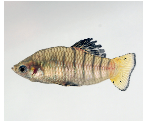
For comparison: A male of the species Limia nigrofasciata | Manfred Scharl