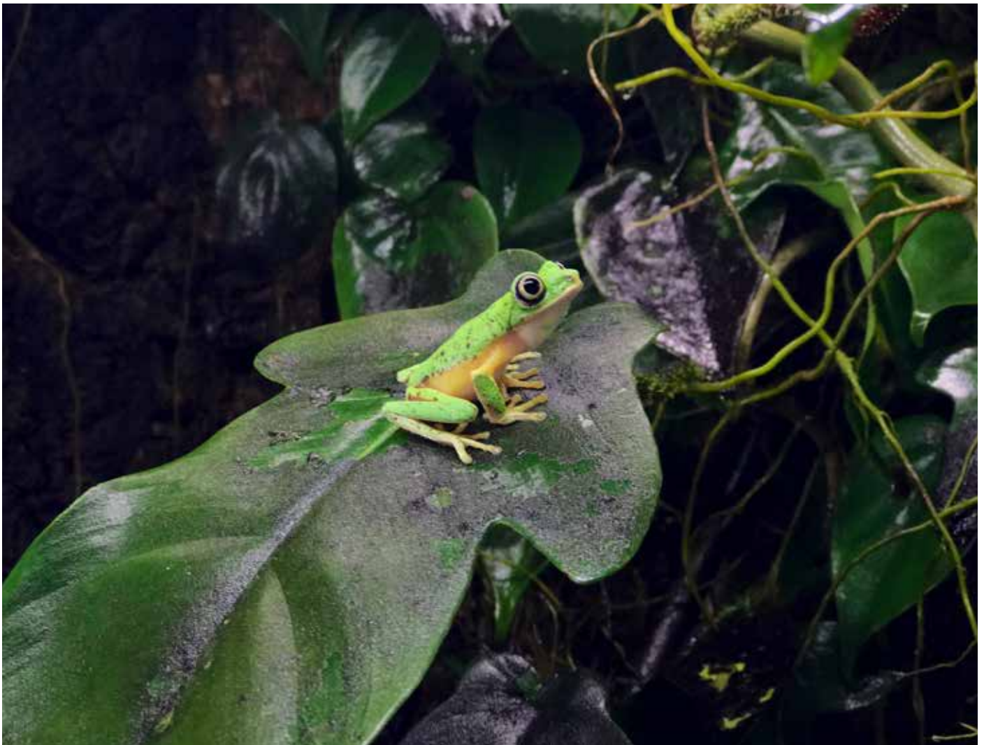
Large-leafed plants make for favourite perches to the frogs

An important factor is that the frogs can access dry spots within their generally tropical moist environment. Ventilation surfaces should therefore be dimensioned so that most plants in the tank will have dried within two hours following a spraying session.