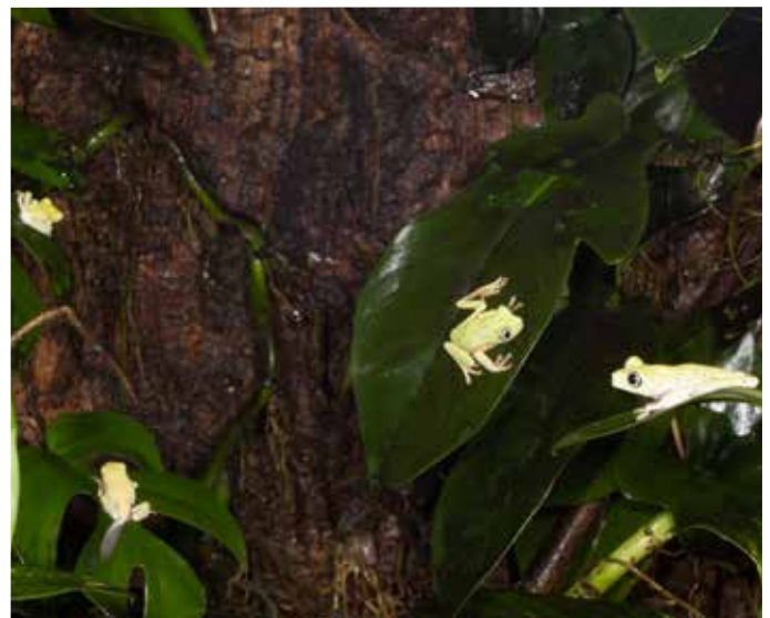
Freshly metamorphosed froglets in the company of their parents