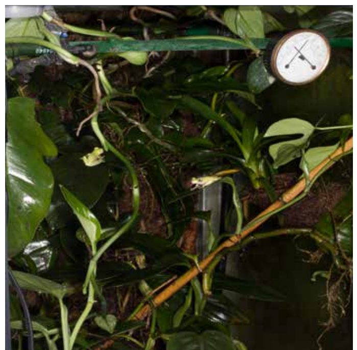
Creating a proper terrarium climate is crucial for keeping the frogs healthy and propagating them