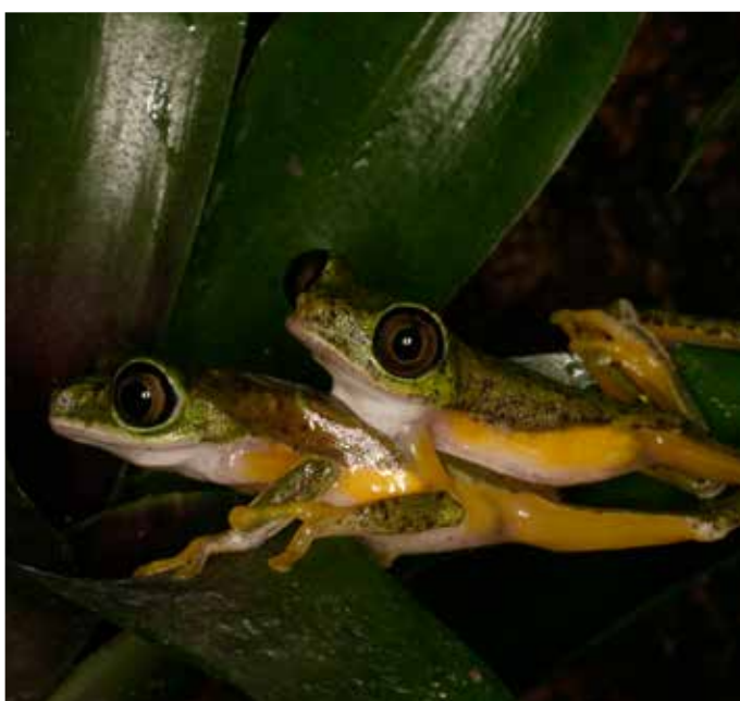
Males competing for the right to mate

This period is then followed up with emulating intense and lasting rains, for example by having an aquarium pump cycle the water from the bottom of the tank through a perforated outlet pipe along the lid back into it (see photos on page 14). This phase may be kicked off by raising the water level with cold water first and then gradually warming it by means of an aquarium heater; this would emulate the situation in nature even more closely.