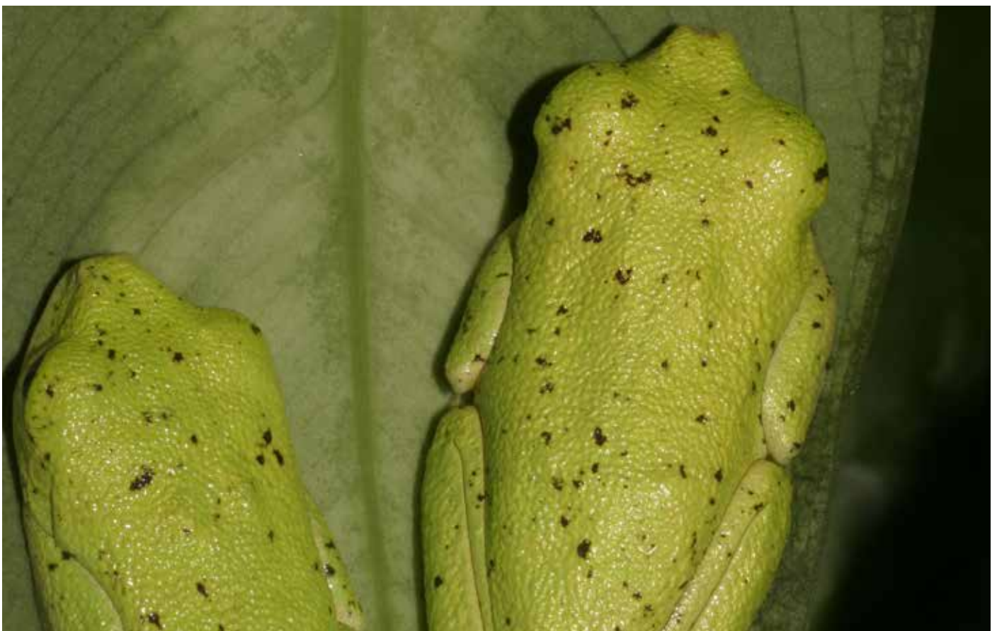
Lemur Leaf Frogs sleep attached to leaves during the day

The original distribution range of Agalychnis lemur used to extend from the border between Panama and Colombia through central Panama to central Costa Rica.