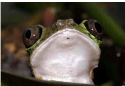
Agalychnis lemur