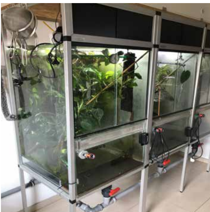
Terraria for keeping Agalychnis lemur

Bromeliads likewise lend themselves to forming part of the vegetation in a terrarium for Lemur Leaf Frogs.