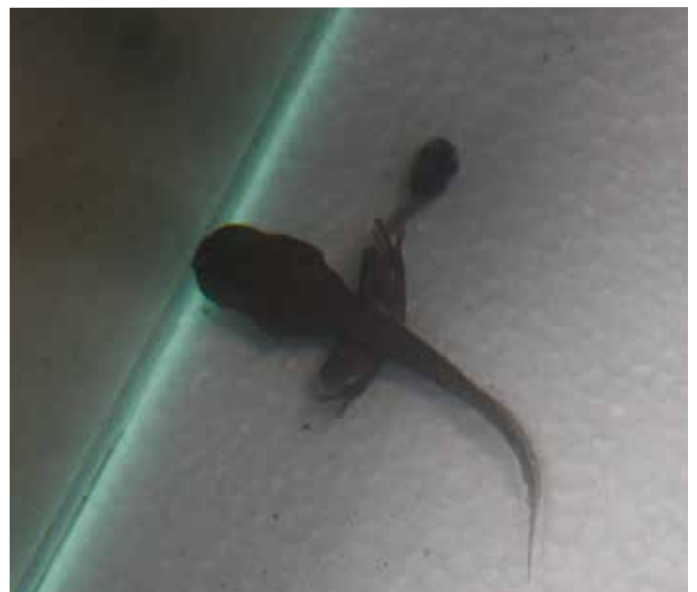
A comparison of sizes: A young and a much advanced tadpole