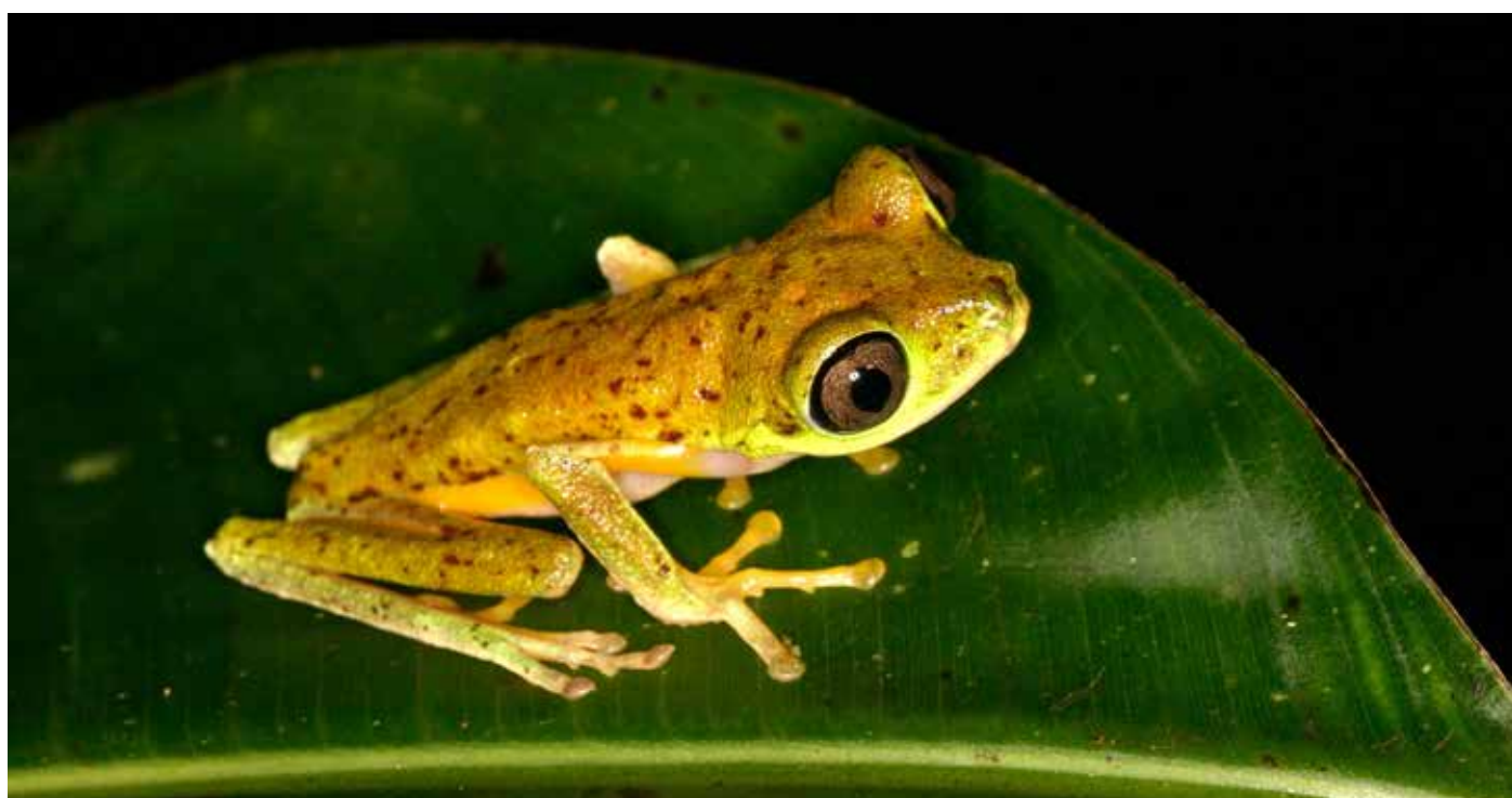
Even well-fed Lemur Leaf Frogs always look a bit emaciated

Right before the feeder insects are released into the terrarium, they are dusted with a vitamin/mineral powder by gently shaking them about in a tall slim container filled with some powder until they are completely covered with it. This is an important precaution against deficiency syndromes.