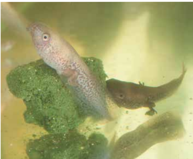
Tadpoles with developing hind legs

Because there is always a possibility that well-acclimatised Lemur Leaf Frogs may mate without prior transfer to a "mating tank" and exposure to a cold phase of heavy "rain", it may so happen that a clutch will go unnoticed in the actual keeping terrarium. The keeper may then be surprised one day to discover small tadpoles swimming in the water bowl. If the larvae happen to fall from the leaf onto dry land rather than into the water, they will often still be able to reach its safety by whipping their muscular tails and thus propelling themselves into it. The entire raising procedure from tadpole to froglet may also be successful without major losses in the normal terrarium if only the latter is large enough and offers favourable conditions. Cannibalism has never been noted in Agalychnis lemur .