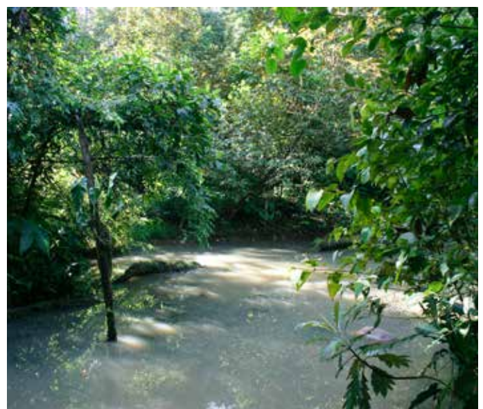
Natural habitat of Agalychnis lemur in Costa Rica

The Lemur Leaf Frog is an inhabitant of rainforests at moderate altitudes from 440 through 1,600 metres above sea level. Forests altered by human intervention are avoided. These frogs are active throughout the year, and particularly so during the rainy seasons.