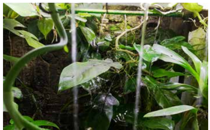
A "downpour" system for the breeding tank that is activated only for stimulating breeding activity; in "normal" day-to-day operations, a raining system with finer sprayheads is used (see photo p. 12 right)