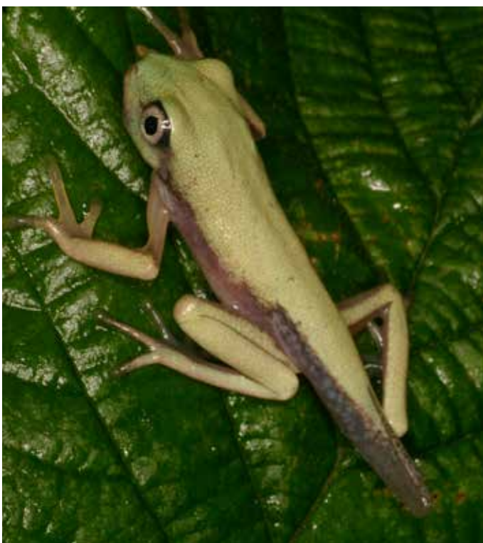
Right after exiting the water and going onto land, the baby Lemur Leaf Frogs will first resorb their tails

Raising may be undertaken in small colonies in terraria that correspond both in climate and outfitting to those used for keeping the adults. Suitable nursery tanks can be fashioned from containers measuring 40 x 40 x 60 cm to 60 x 40 x 60 cm (length x width x height) for 20–40 juveniles each. Hygiene is of utmost importance at this stage, not at least because the density of specimens will be relatively high by comparison. Faeces and perished feeder insects therefore need to be removed often, and the water must be replaced at regular intervals, too. The former will be much easier if there is no bottom substrate. Instead, you may want to install a glass pane at an angle and a drain at the deepest point so that your regular spraying will already flush most detritus away.