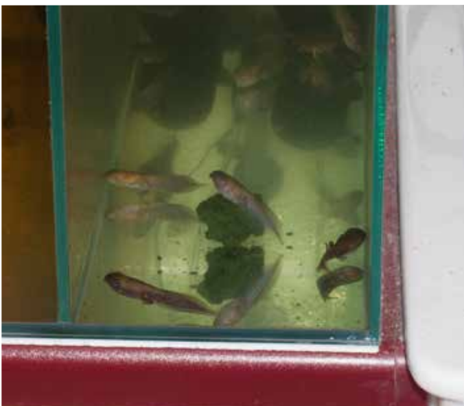
An aquarium for raising larvae

If you opt for incubating the eggs separately, the leaf carrying the clutch is cut off and placed in a box or a small aquarium with a low level of water. The leaf is mounted a few centimetres above the water surface, for example by pegging it to a halved plastic bottle (EISENBERG & KAESLING 2012). The air temperature within the “incubation box” should be about 24 °C. Placing a pane of glass at a slight angle over the top of the tank will help to keep humidity levels high while at the same preventing water condensing on the glass from dripping onto the clutch. If a clutch has not been firmly attached, its leaf may also be positioned horizontally in the incubation tank, or it may even be removed entirely, so that the eggs cannot slip into the water. Eggs falling into the water will not develop any further.