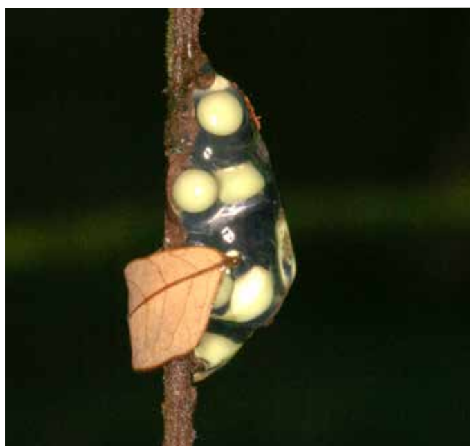
A clutch attached to a branch in the natural habitat | Photo: Tobias Eisenberg